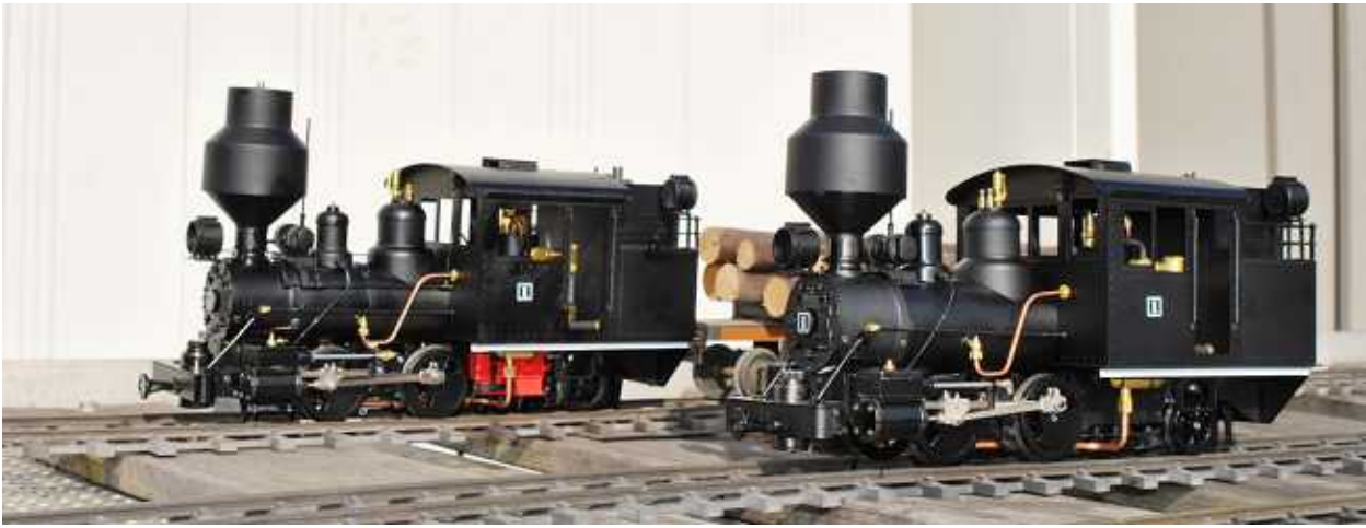
Two Tanks - the basic model (nearer) and the fully detailed (behind)