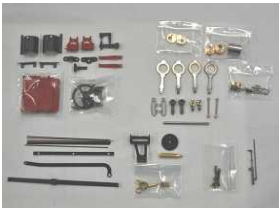
contents of an option kit: (left) Stephenson's valve gear components reverser parts additional detail casting parts & pipings