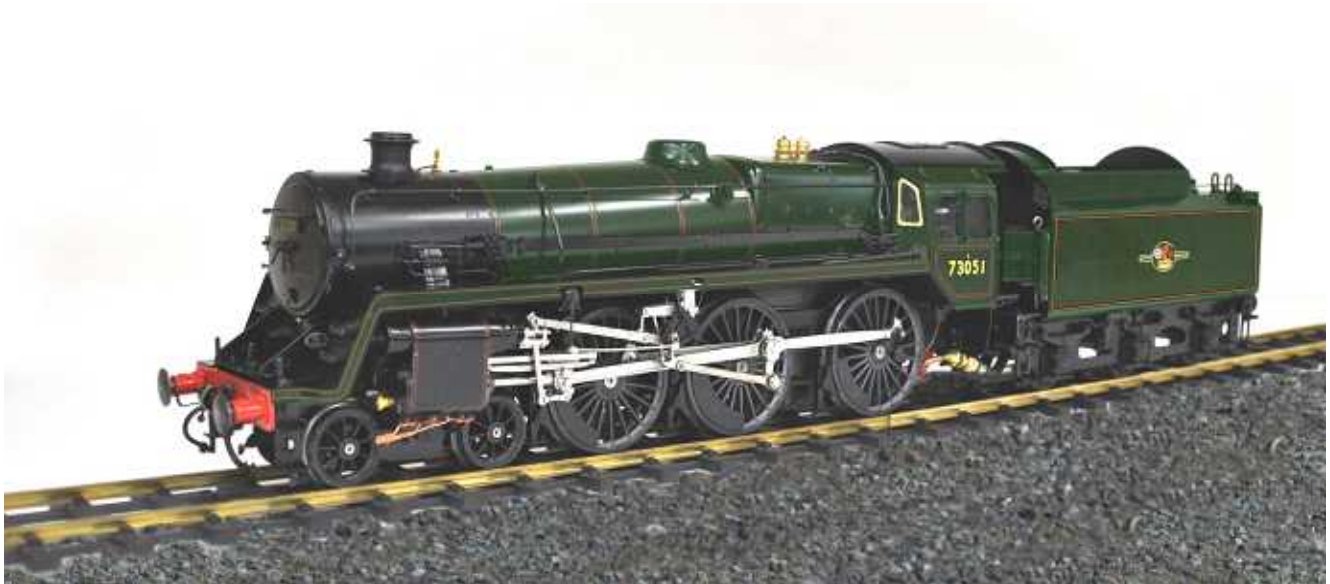
green version (Photoshop Image)

Like BR9F in 2006, black kit will not have a cab side number 73050 and the tender lion crest as shown in the pic below. The green kit will not have the cab side numbers 73051. Please be careful when collecting reservations. The Factory built model will have those numbers and crest upon your firm order by April 9th . To secure your reservation, your earliest order is highly appreciated.